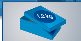
Light weight flexibility